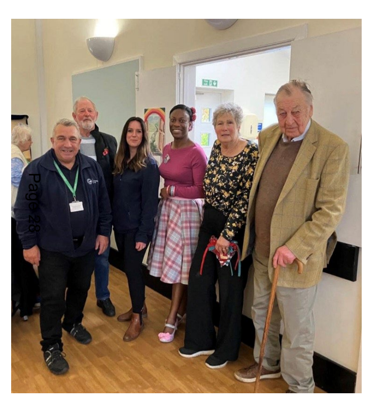
Newton Longville Warm Wednesday

If your community group or organisation can offer a Welcoming Space to local people needing somewhere to go for some company and warmth this winter, you can register for free and access our toolkit to help you get started via our website: <u>Community toolkit: register as a</u> <u>Welcoming Space | Buckinghamshire</u> Council.